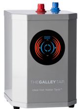
Ideal Hot Water Tank™ (Included)

Solid 316L Machined Stainless Steel Construction Forward rotating COMFORTFEEL™ lever handles Hot side lever is spring loaded for automatic shutoff 1/4 turn Ceramic disk cartridges Spout rotates 360° Laminar Ideal Flow. Thermally insulated spout Provides filtered (not included), hot water, 208°F max temperature Provides filtered (not included), cold water (not chilled) Optional base ring included 8 7/8" fill height from deck to spout outlet Total height 13 1/4" .50 GPM maximum flow rate for hot water 1.30 GPM maximum flow rate for cold (not chilled) water Maximum counter thickness 2 1/4" Minimum install hole diameter 1 3/8" Compatible with reverse osmosis filtration systems Limited Lifetime Mechanical and Finish Warranty For use with Water Filtration System* (not included) For use with Ideal Hot Water Tank™ (included) *Note: May reduce water flow