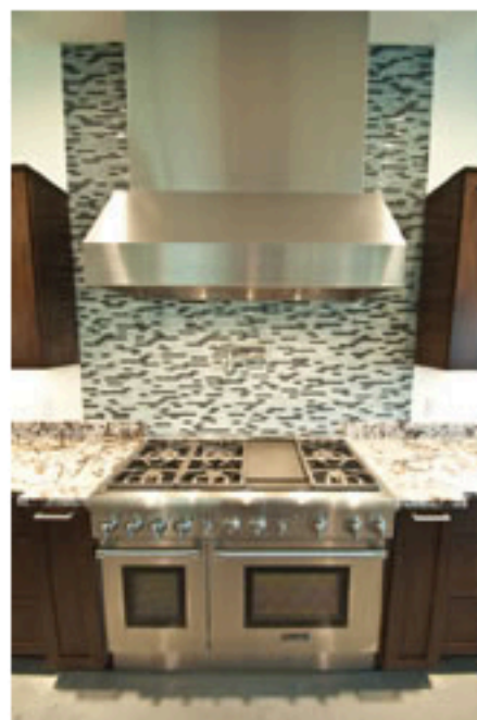
The Thermador gas range is accented with pencil tile and a stainless vent hood.

The steam shower’s dark gray tile and stainless steel accent band provide a masculine touch in the utilitarian space, while the same espresso-stained cabinets, Carrera marble countertops and radiant-heated concrete floors reflect light from the six clerestory windows encompassing the room.