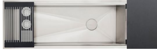
Graphite Wood Composite