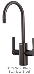
PVD Satin Black Stainless Steel