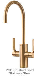
PVD Brushed Gold Stainless Steel Limited Edition