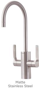
Matte Stainless Steel