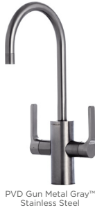
PVD Gun Metal Gray™ Stainless Steel