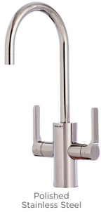
Polished Stainless Steel