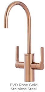
PVD Rose Gold Stainless Steel Limited Edition