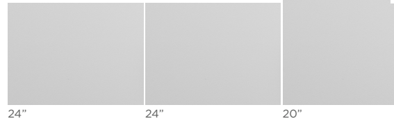
Exclusive Gray Resin