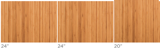
Natural Golden Bamboo