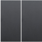
9" 9" Graphite Wood Composite