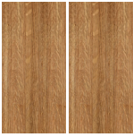
9" 9" Quartered White Oak