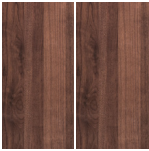
9" 9" American Black Walnut