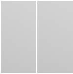
9" 9" Exclusive Gray Resin