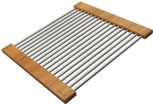
Natural Golden Bamboo