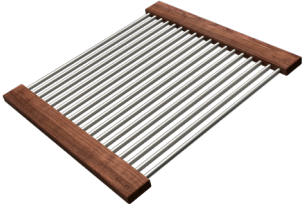
American Black Walnut