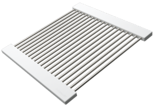
Designer White Resin