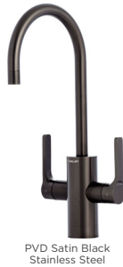
PVD Satin Black Stainless Steel