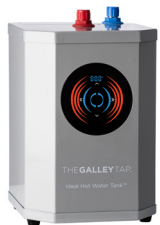
Ideal Hot Water Tank™ (Included)

Solid 316L Machined Stainless Steel Construction Forward rotating COMFORTFEEL™ lever handles Hot side lever is spring loaded for automatic shutoff 1/4 turn Ceramic disk cartridges Spout rotates 360° Laminar Ideal Flow® Thermally insulated spout Provides filtered (included), hot water, 208°F max temperature Provides filtered (included), cold water (not chilled) Optional base ring included 8 7/8" fill height from deck to spout outlet Total height 13 1/4" .50 GPM maximum flow rate for hot water 1.30 GPM maximum flow rate for cold (not chilled) water Maximum counter thickness 2 1/4" Minimum install hole diameter 1 3/8" Compatible with reverse osmosis filtration systems Limited Lifetime Mechanical and Finish Warranty For use with Water Filtration System* (included) For use with Ideal Hot Water Tank™ (included) *Note: May reduce water flow