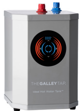
Ideal Hot Water Tank™ (Included)

Solid 316L Machined Stainless Steel Construction Forward rotating COMFORTFEEL™ lever handles Hot side lever is spring loaded for automatic shutoff 1/4 turn Ceramic disk cartridges Spout rotates 360° Laminar Ideal Flow® Thermally insulated spout Provides filtered (included), hot water, 208°F max temperature Provides filtered (included), cold water (not chilled) Optional base ring included 8 7/8" fill height from deck to spout outlet Total height 13 1/4" .50 GPM maximum flow rate for hot water 1.30 GPM maximum flow rate for cold (not chilled) water Maximum counter thickness 2 1/4" Minimum install hole diameter 1 3/8" Compatible with reverse osmosis filtration systems Limited Lifetime Mechanical and Finish Warranty For use with Water Filtration System* (included) For use with Ideal Hot Water Tank™ (included) *Note: May reduce water flow