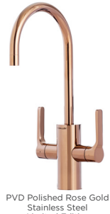
PVD Polished Rose Gold Stainless Steel Limited Edition